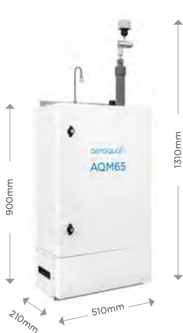
AQM 65 with integrated calibration