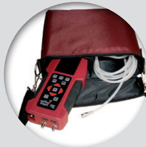
Convenient nylon bag