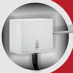
Gas sampling probe HD heated, with ceramic filter and back-purge