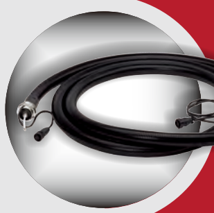
Gas sampling line Teflon, heated with temperature regulation