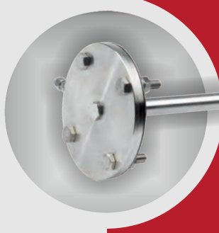
Gas sampling probe LD unheated, with in-situ sintered metal filter