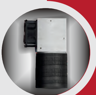
Thermoelectric gas cooler Peltier type with condensate monitoring and alarm